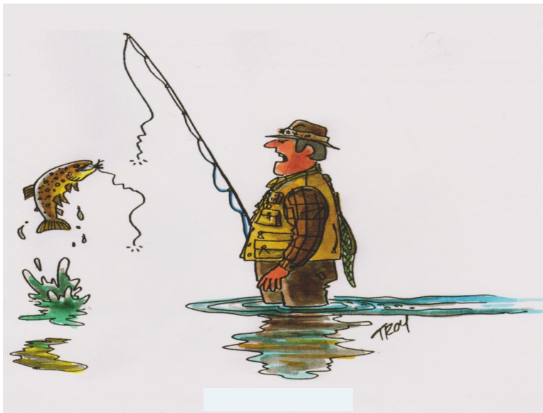
"I see it, I see it..."

Miso Sablefish With garlic rice, Asian slaw & cured cucumbers