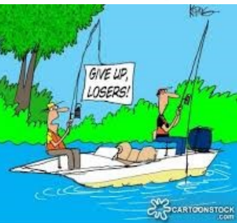
"I caught something, but it's not a fish. And speaking of fish, I think they know we're here."