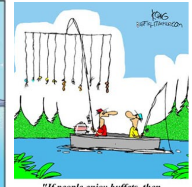
"If people enjoy buffets, then maybe the fish will too."