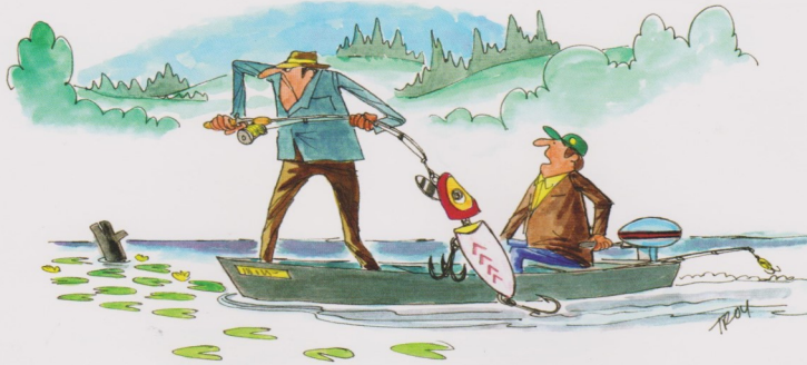
"I see you're a firm believer in the 'Large Bait, Large Fish Theory!'"