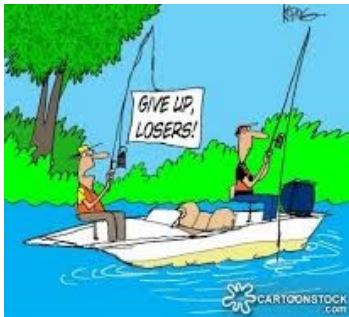
"I caught something, but it's not a fish. And speaking of fish, I think they know we're here."

Macaroni and Cheese, with Crabmeat, Cream Cheese and White Wine